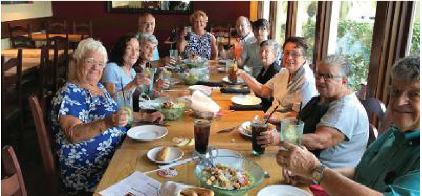
District 14 Luncheon – 7/21/2021